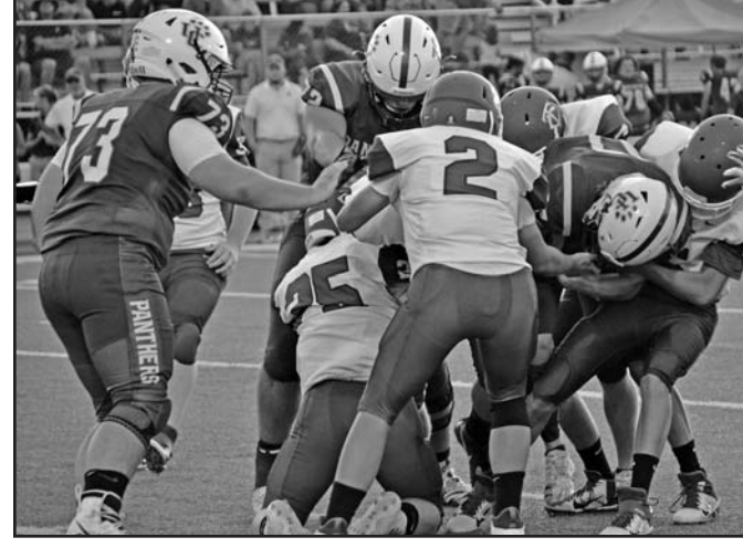
The Indians swarm a Panther ball carrier.